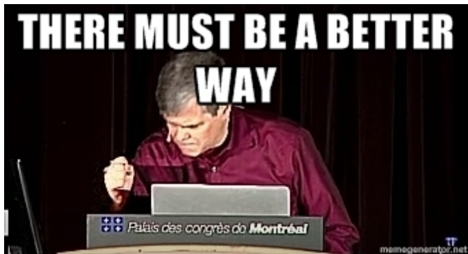
Figure 1: Raymond Hettinger