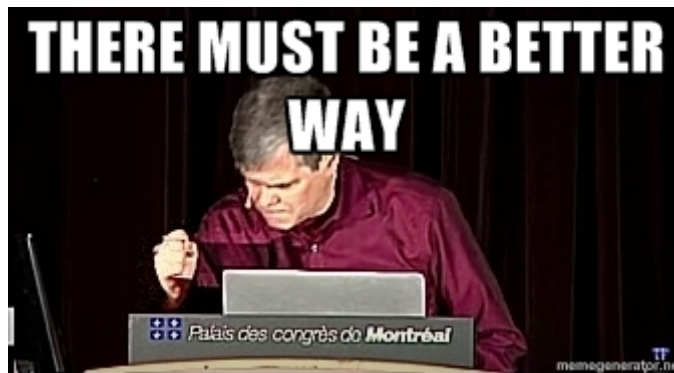
Figure 1: Raymond Hettinger

Let us assume that scientific research papers consists of only 3 steps (if only!) - notetaking, analysis and presentation. Word fails at delivering at all these tasks. Word doesn't quite work for notetaking. Org mode, Evernote or Onenote are most people's preferred solution. Word doesn't fit data analysis requirements as well, with Python, R or Excel being the go-to tools. I personally use Emacs / Vim for notetaking and store them in a git repository and all of my data analysis is done in Jupyter Notebooks. After collecting the required data from an experiment and post-processing it, I can save plots into an image or the data into a table in a particular format programmatically using scripts. Word however, does not allow me to import these images or tables programmatically. If I did somehow manage to contort my workflow and store my data and information in this software, I have absolutely no way of retrieving it. The final presentation/report/paper, information and data will exist confined in this closed source proprietary software. Word just does not fit into an analysis or research workflow. To quote Raymond Hettinger :